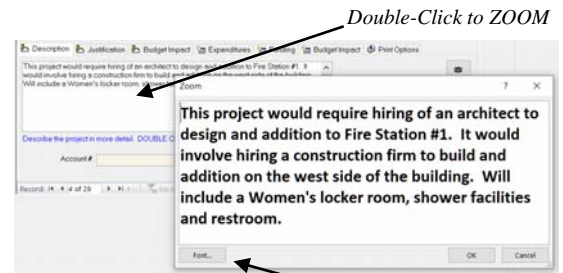
Double-Click to ZOOM